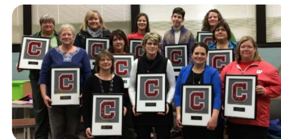
COLUMBUS ELEMENTARY & DISCOVERY CHARTER SCHOOLS STAFF

Congratulations and a sincere thank you for your years of service to the students, parents, and community of the Columbus School District.