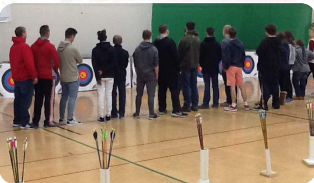
COLUMBUS HIGH SCHOOL STUDENTS ARE PARTICIPATING IN AN ARCHERY UNIT IN PHY ED.