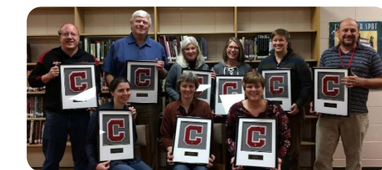
COLUMBUS HIGH SCHOOL STAFF