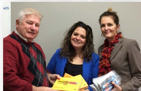
COLUMBIA COUNTY RETIRED TEACHERS DONATED CLASSROOM SUPPLIES FOR THE LITERACY PROGRAM AT COLUMBUS ELEMENTARY & DISCOVERY CHARTER SCHOOLS.