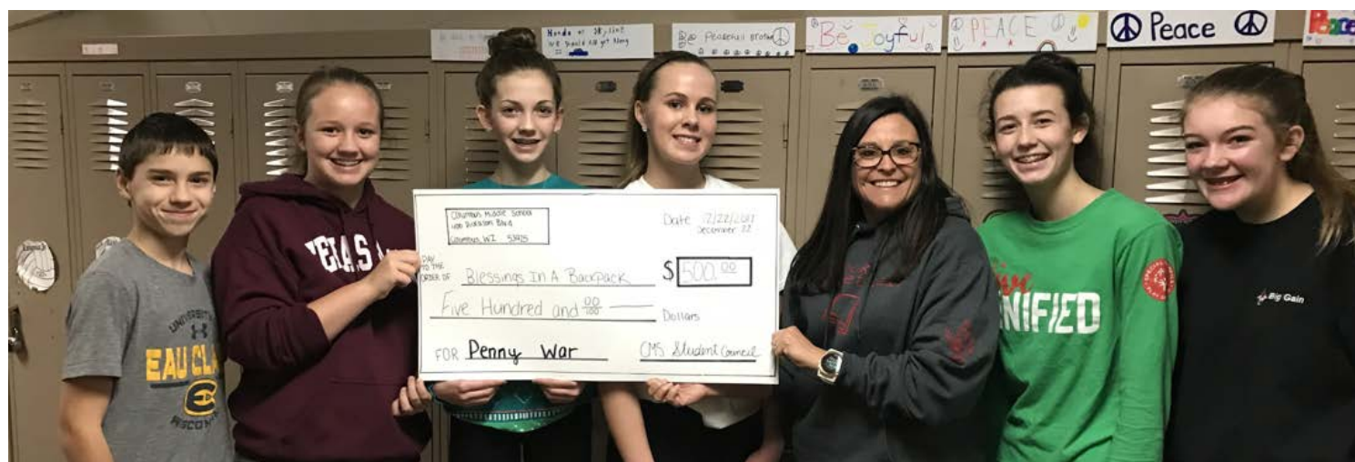
COLUMBUS MIDDLE SCHOOL STUDENTS RAISED $500 FROM THE DECEMBER PENNY WAR. THEY DONATED THE MONEY TO BLESSINGS IN A BACKPACK. FOR MORE INFORMATION ABOUT THE BLESSINGS IN A BACKPACK PROGRAM GO TO