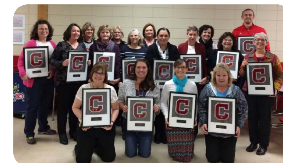
COLUMBUS MIDDLE SCHOOL & DISTRICT OFFICE