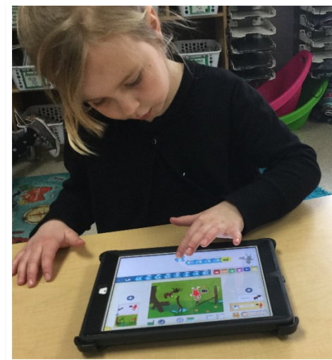
FIRST GRADERS LEARN TO CODE IN PROJECT LEAD THE WAY.

Due to the inclement weather day in February, there will be school for students on Monday, June 4 th .