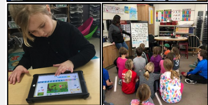
Six significant priorities were chosen by Community to work on from 2017 - 2020